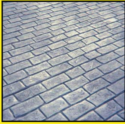
Old Englysh Cobblestone