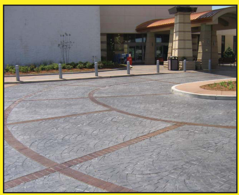
European Fan with 4" x 8" Slate Radius Soldier Course

MATCRETE three dimensional texturing tools are of the highest quality and produce the richest textures for decorative concrete and stampable overlays. Used to create the appearance of natural materials such as brick, cobblestone, slate, stone, tile and wood in an array of original designs and unique patterns.