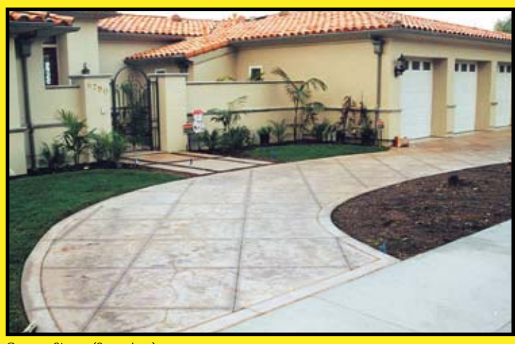
Caesar Stone (Seamless)