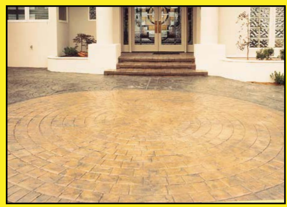
Slate Cobblestone Circle with European Fan