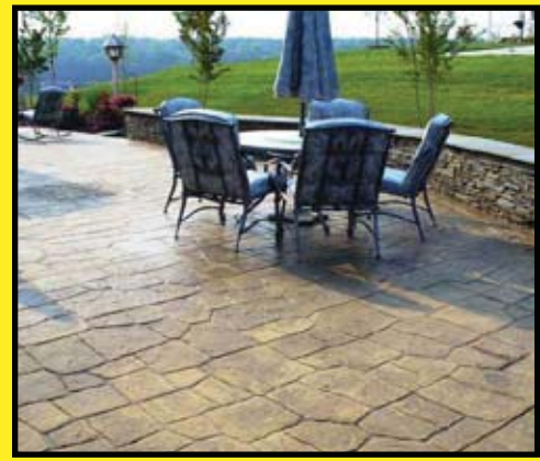
Bavarian Castle Stone