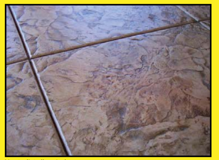
Monster Slate (Seamless)