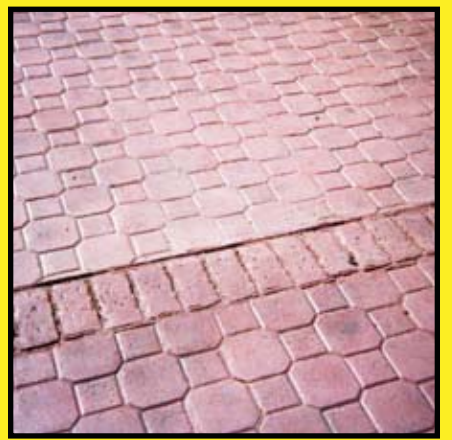
Holland Cobble Paver with Old Brick Soldier Course