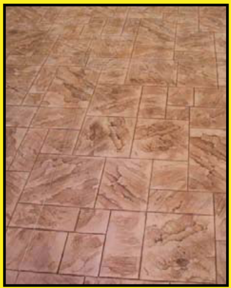
La Habra Ashler Slate