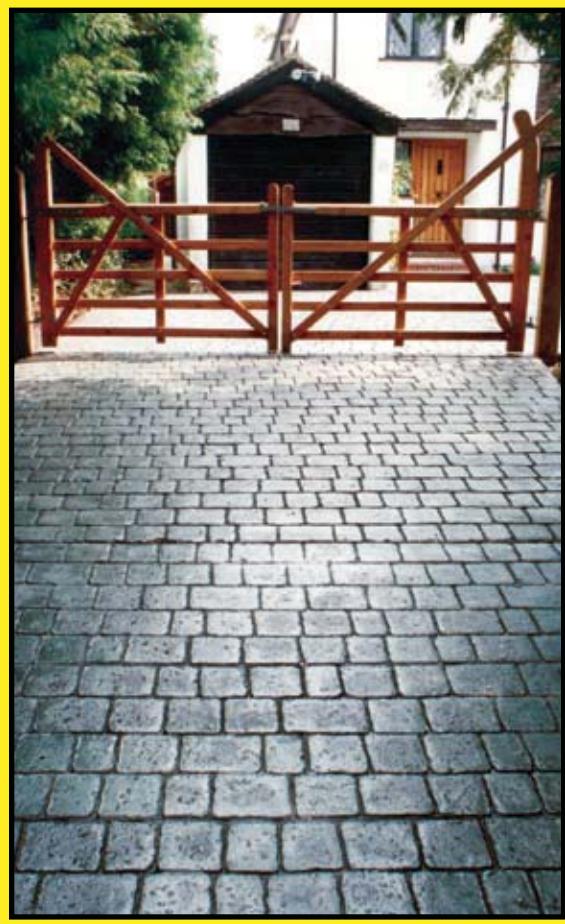
Deep Joint Slate Cobblestone