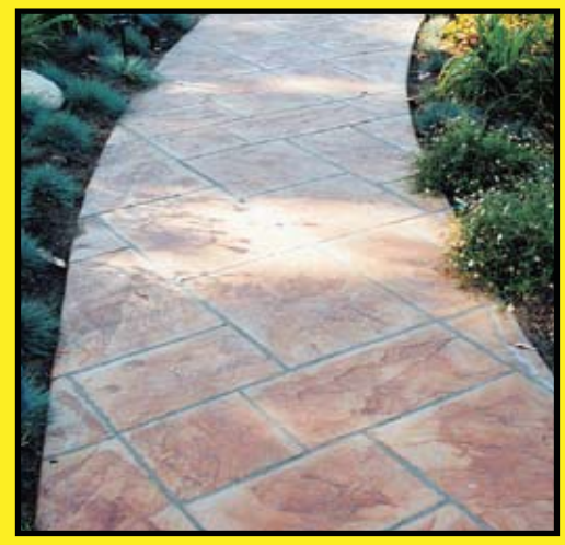
Extra Large Ashler Slate