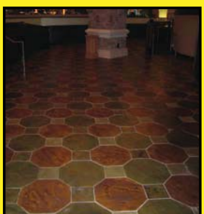
La Paz Slate