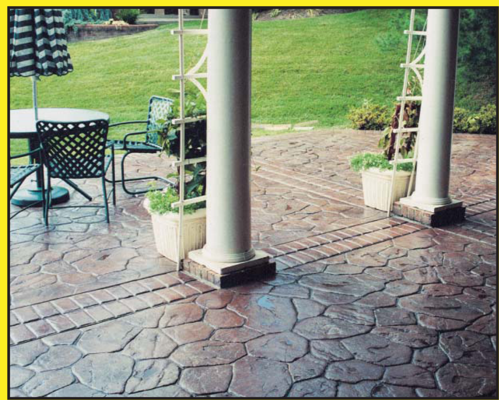
Random Stone with New Brick Double Soldier Course