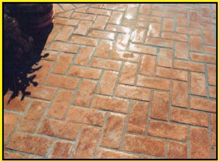
New Brick Herringbone