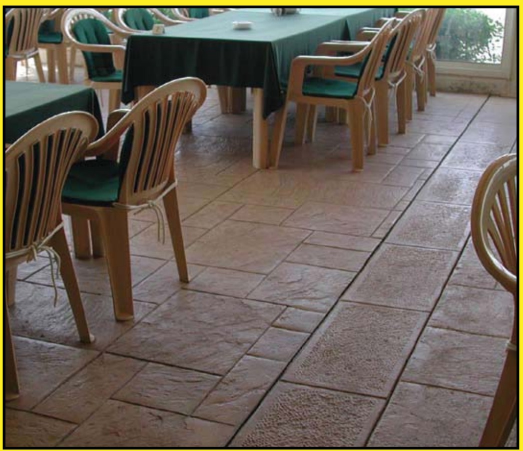
Royal Ashler Slate with Jerusalem Stone Border