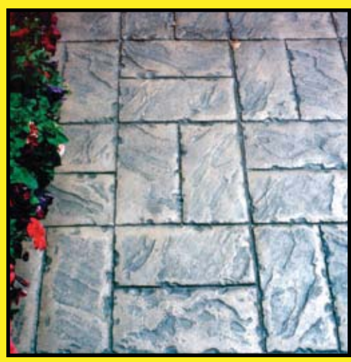
6" x 12" Basket Weave Stone