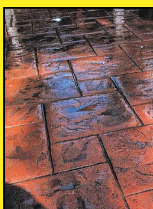
Opa Locka Stone