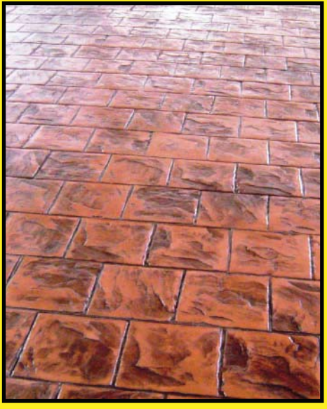
12" Slate Running Bond