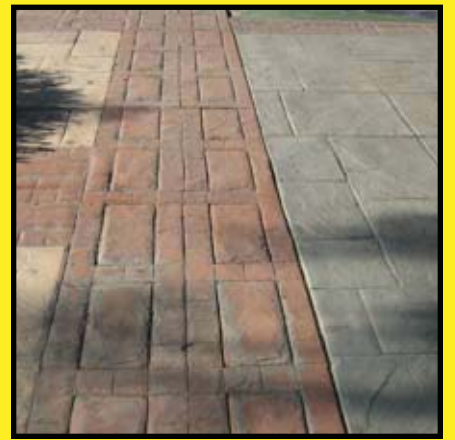
8" x 16" Slate with 4" Tile