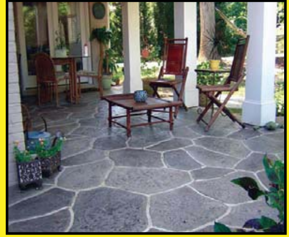
Grand Canyon Stone