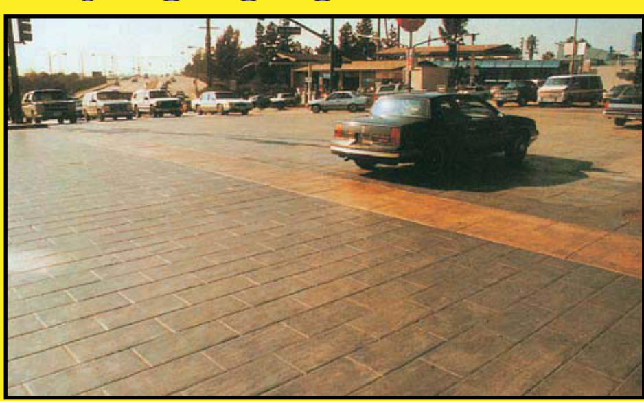
12" x 24" Italian Slate Running Bond

MATCRETE offers versatility, durability, weed free, low maintenance, cost effectiveness in a multitude of styles and a variety of colors.