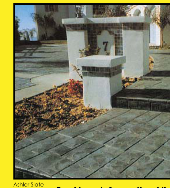
For More Information Visit www.matcrete.com