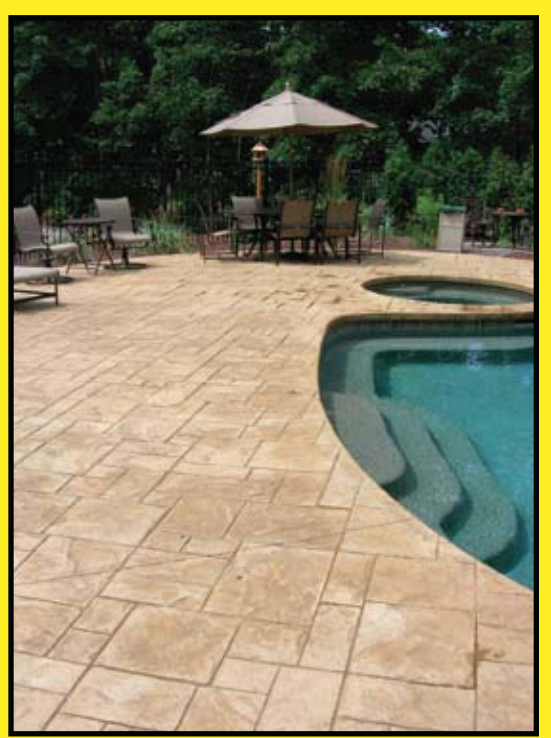
Grand Ashler Slate