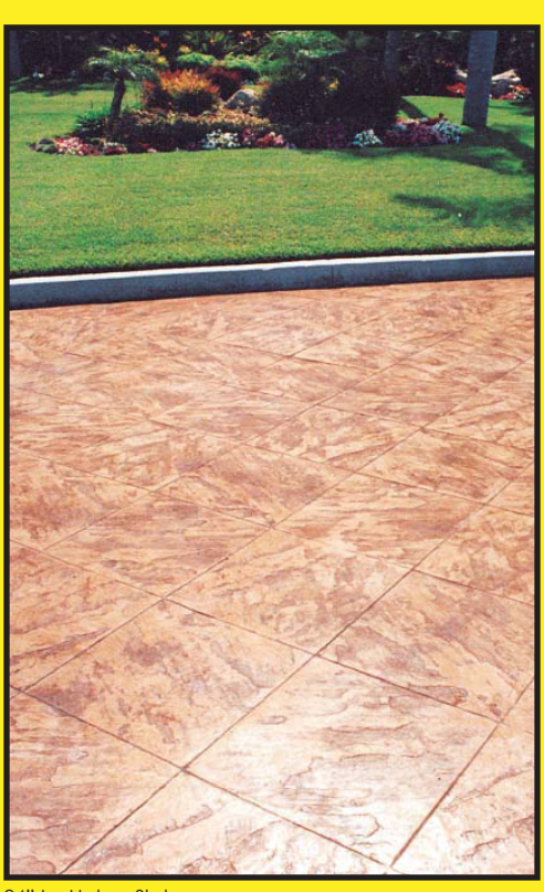
24" La Habra Slate