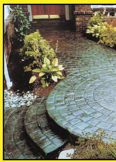
Slate Cobblestone Circle with London Cobblestone