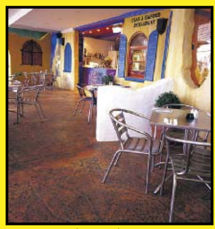
French Granite (Seamless)