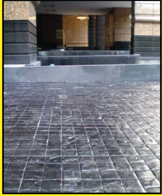
4" Monte Carlo Tile