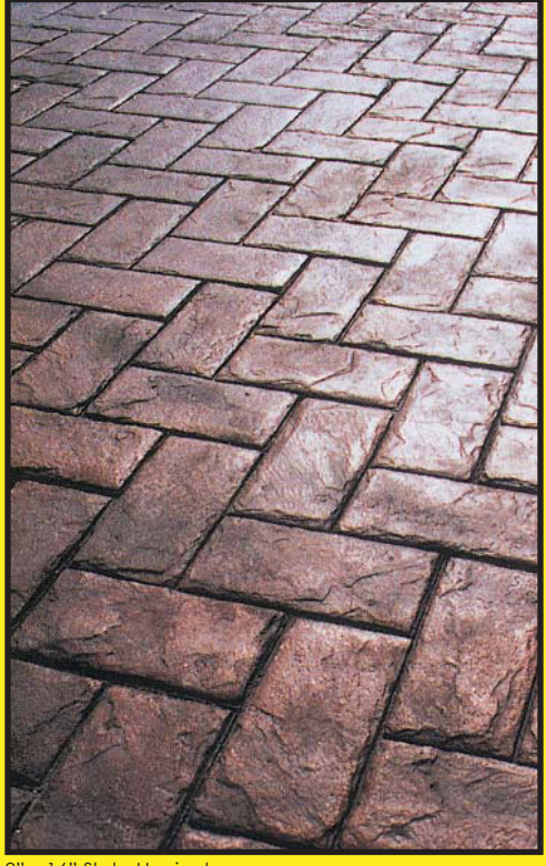
8" x 16" Slate Herringbone