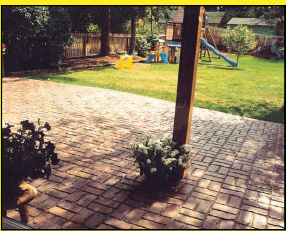
Old Brick Basket Weave